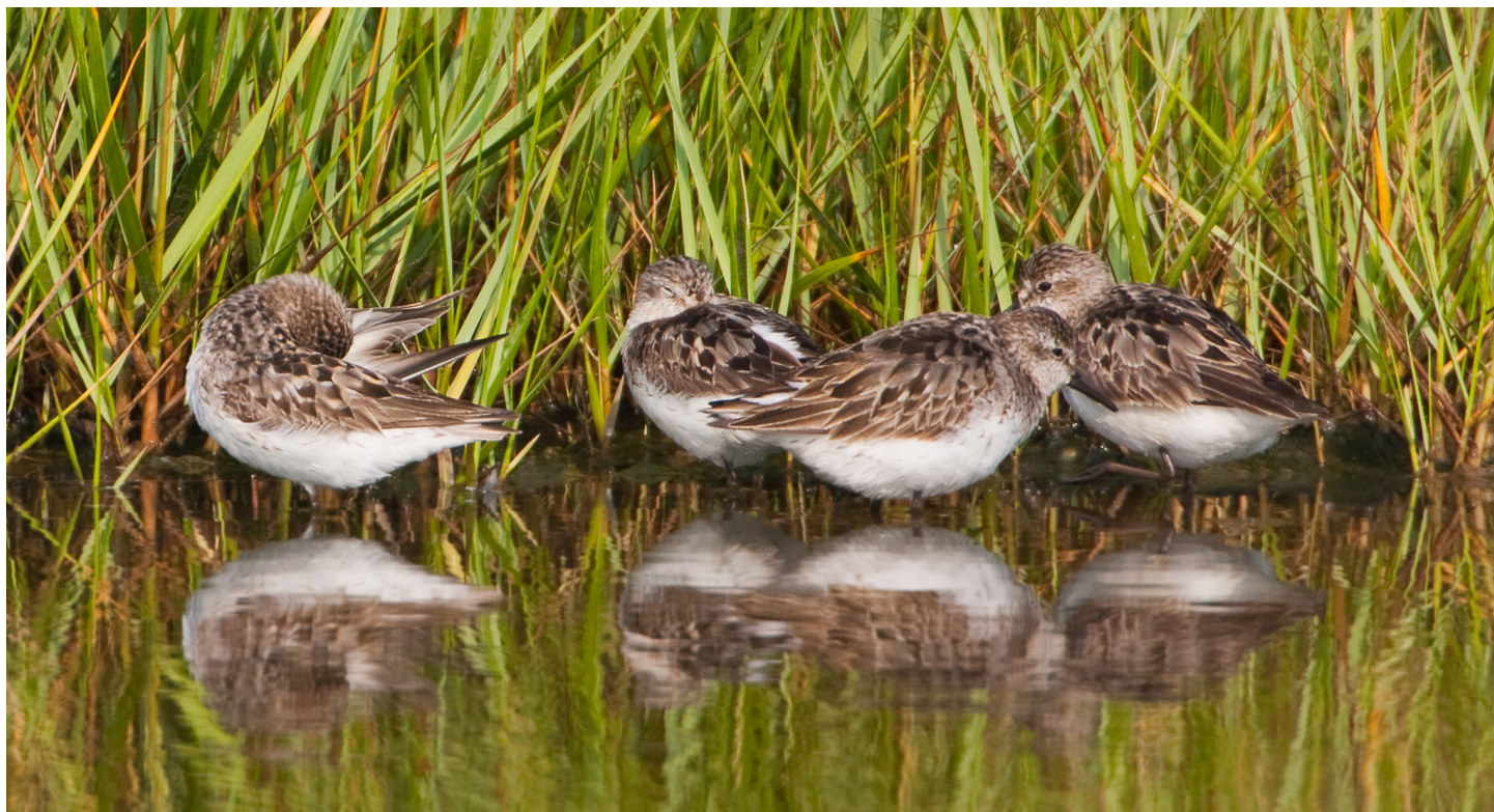
Semipalmated sandpipers resting in a salt marsh in Massachusetts