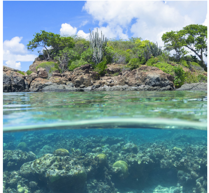
Corals in coastal Puerto Rico

Restore the three-dimensional structure across coral reefs that were severely damaged by Hurricanes Irma and Maria. Project will use a multi-method restoration approach that combines the out-planting of artificial coral colonies created with emerging 3D printing technology with multispecies out-plants composed of morphologically complex branching and massive corals.