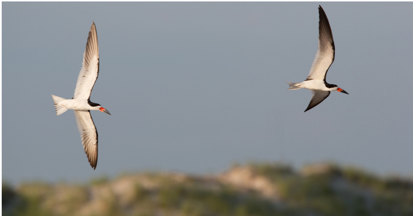
Black skimmers flying over dunes in coastal New York