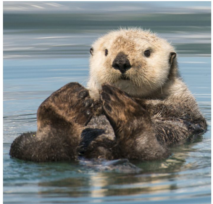
Sea otter in coastal Alaska

Develop a publicly informed and community-supported design to restore and strengthen Marin City’s urban wetland. Project will improve the functionality and resilience of wetland habitat that will serve as shoreline protection from storms and floods while supporting birds and other wildlife, and providing much-needed opportunities for local residents to engage with nature.