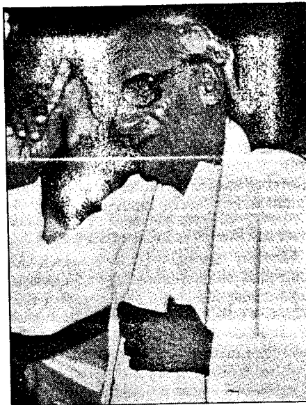
The "Orator" making a point