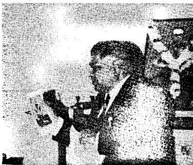
Father admiring son's handiwork