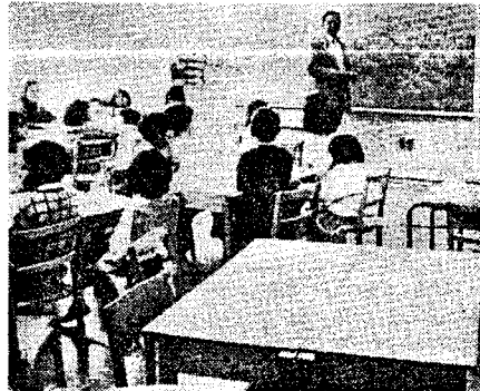
Language class in progress