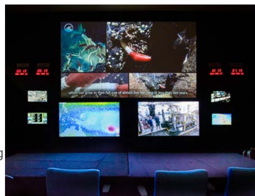
An Exploration Command Center (ECC) at Underwater World Guam.

Telepresence streamlines other data management tasks with a custom suite of software and standard operating procedures that automatically collect raw and some processed data from all the different acquisition computers, and then move that data to a central server called the data warehouse. Then the system automatically moves all the data over the satellite connection to shore as bandwidth is available. Once the data are in the data warehouse, any member of the science team can access the data on an FTP site.