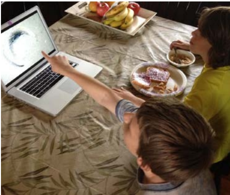
Telepresence technology allows anyone with Internet to follow an exploration...even over breakfast while on vacation. Image courtesy of NOAA Okeanos Explorer Program, Gulf of Mexico 2014 Expedition. http://oceanexplorer.noaa.gov/okeanos/explorations/ex1402/logs/apr18_b/media/tarttboys.html