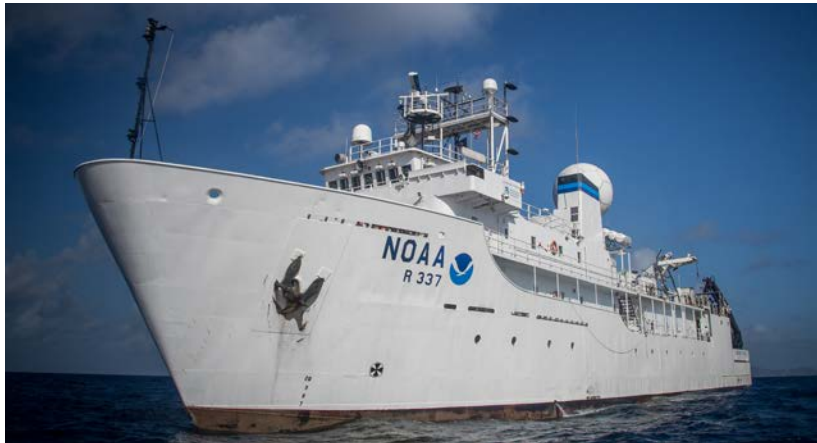
The NOAA Ship Okeanos Explorer, America's ship for ocean exploration.

and pitch to keep the antenna pointed toward the appropriate communications satellite. Radio transmitters and receivers connected to the VSAT antenna operate on "C-band" frequencies, which are in the microwave region of the electromagnetic spectrum.