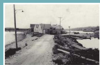
Summer School of Graphic Arts, 1920s