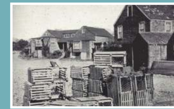
Ice House, 1930s