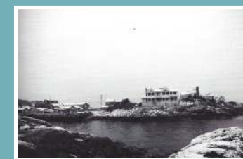
Island House, 1920s