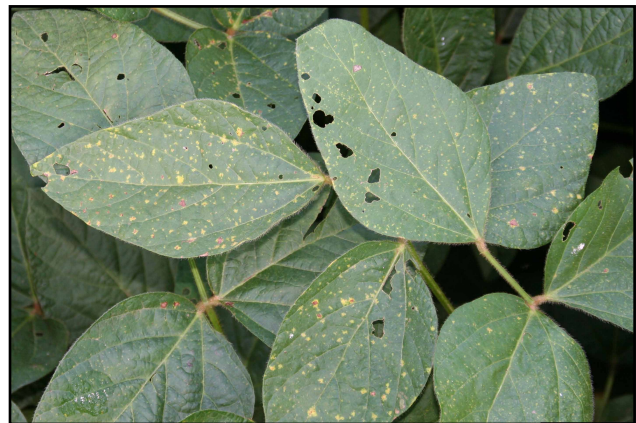
FIGURE 1. DOWNY MILDEW OF SOYBEAN.

When pods are infected, an encrusted mass of fungal-like growth is visible inside the pods. Infected seed has a dull white appearance and is partially or completely encrusted with the pathogen (FIGURE 4). This