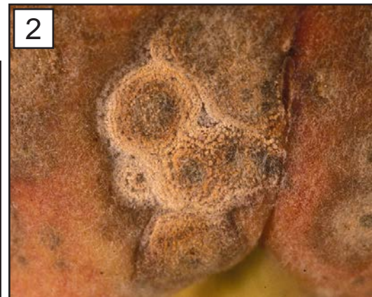
FIGURE 1. ANTHRACNOSE FRUIT ROT LESIONS ARE CIRCULAR, SUNKEN, AND TAN. FIGURE 2. SIGNS OF THIS DISEASE INCLUDE FUNGAL FRUITING BODIES IN CONCENTRIC CIRCLES EXUDING SPORE MASSES.