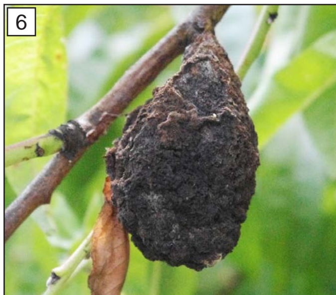
FIGURE 4. BROWN ROT CAUSES SOFT, CIRCULAR LESIONS THAT RAPIDLY EXPAND TO THE ENTIRE FRUIT.

Decay begins as small circular brown spots that rapidly expand (FIGURE 4) to a soft, brown decay of entire fruit (FIGURE 5). Under humid conditions, masses of brown or gray spores (conidia) develop in infected areas, often covering large portions of fruit. Diseased fruit become dry and hard (mummify) and either remain attached to trees (FIGURE 6) or drop. Damaged fruit, ripening fruit, and fallen fruit are most susceptible to infection. The brown rot fungus also causes blossom blight and twig blight in spring.