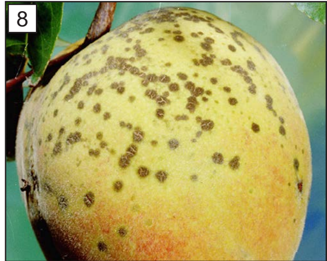
FIGURE 8. LESIONS MAY CRACK AND MERGE TOGETHER.

Scab ( Cladosporium carpophilum ) Initially, very small, circular, green-to-black velvety spots form on young fruit, usually near the stem end (FIGURE 7). Spots become darker, expand to 1/4 inch diameter, and may crack (FIGURE 8). Lesions may merge together if disease is severe, and fruit may drop in extreme cases. A corky layer underneath the skin develops but does not expand into the flesh. Twigs and leaves may also become infected.