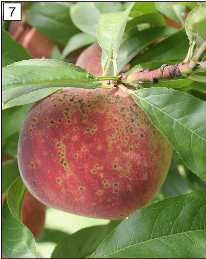
FIGURE 7. PEACH SCAB RESULTS IN SMALL, CIRCULAR, VELVETY SPOTS ON FRUIT SKIN.

Scab ( Cladosporium carpophilum ) Initially, very small, circular, green-to-black velvety spots form on young fruit, usually near the stem end (FIGURE 7). Spots become darker, expand to 1/4 inch diameter, and may crack (FIGURE 8). Lesions may merge together if disease is severe, and fruit may drop in extreme cases. A corky layer underneath the skin develops but does not expand into the flesh. Twigs and leaves may also become infected.