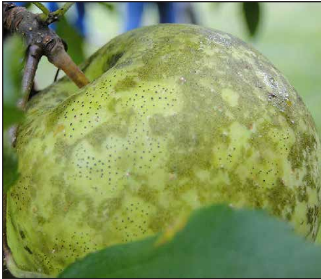
FIGURE 2. SOOTY BLOTCHES AND SPECKS ARE OFTEN MORE OBVIOUS ON LIGHT-COLORED FRUIT, SUCH AS 'GOLDEN DELICIOUS' SHOWN HERE.

in groups of just a few to over a hundred. Multiple clusters may be present on a single fruit. Blotches and specks often appear together on the same fruit. SBFS occurs in the waxy cuticle of apple fruit and does not cause decay. However, the fungi can disrupt this protective waxy layer resulting in moisture loss (desiccation), shortening storage life.