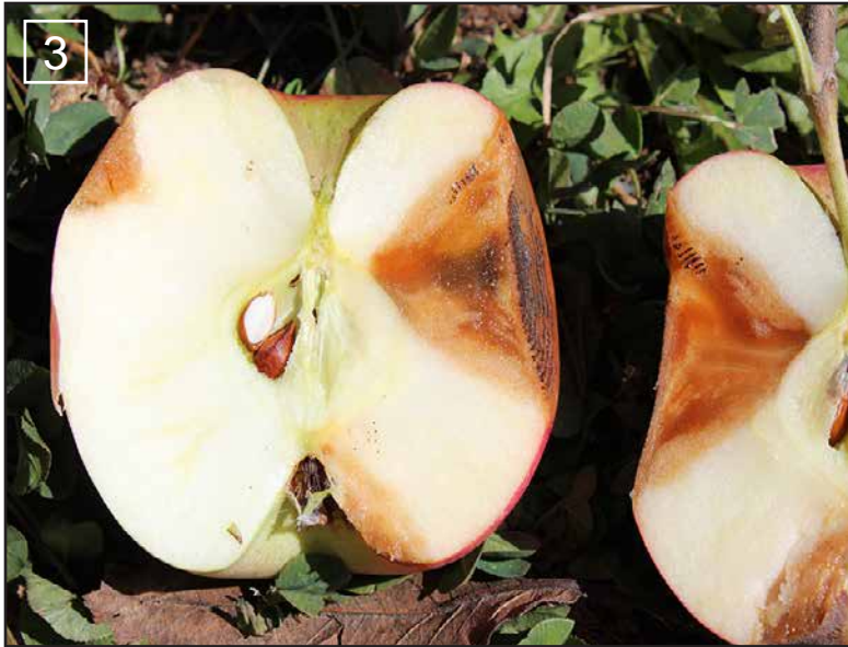
FIGURE 3. INTERNAL V-SHAPED ROT IS AN IDENTIFYING CHARACTERISTIC OF BITTER ROT.