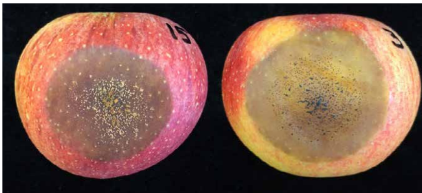
FIGURE 5. DIFFERENCES IN APPEARANCE BETWEEN COMPLEXES CAN OFTEN BE OBSERVED BY SPORULATION PATTERNS. SPECIES WITHIN THE C. ACUTATUM COMPLEX PRODUCE ORANGE CONIDIAL (SPORE) MASSES DURING WET CONDITIONS (LEFT), WHILE C. GLOEOSPORIOIDES COMPLEX SPECIES DEVELOP BLACK ACERVULI (FRUITING STRUCTURES) AND NO ORANGE CONIDIAL MASSES (RIGHT).

When weather warms, fungi produce fruiting structures (acervuli) on the surface of plant tissues. During wet conditions, these structures absorb water and release infective spores (conidia). Some species