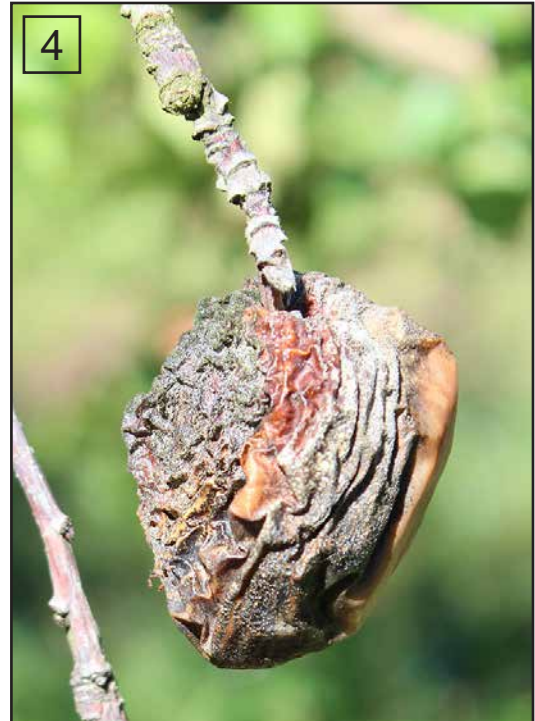
FIGURE 4. INFECTED FRUIT MAY REMAIN ATTACHED TO TREES AS MUMMIES AND SERVE AS INOCULUM SOURCES FOR SUBSEQUENT SEASONS.

individual species, respectively. Previous literature (and some current publications) reference species complex instead of the specific species within the complex. To date, 12 individual species of Colletotrichum have been identified as fruit rot pathogens in the Southeastern U.S. (TABLE 1). In Kentucky, six individual species are known to cause apple bitter rot. Species identification is important because individual species exhibit differences in: