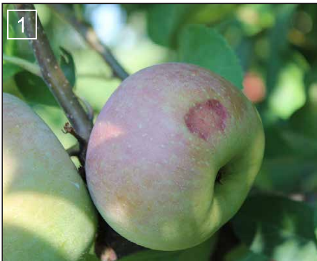
FIGURE 1. THE FIRST SYMPTOMS OF BITTER ROT ARE SMALL TO MEDIUM-SIZED, SLIGHTLY SUNKEN LESIONS.

Bitter rot is a fungal disease caused by multiple species within the Colletotrichum acutatum and Colletotrichum gloeosporioides sp. complexes (FIGURE 5). Each complex contains 34 and 38