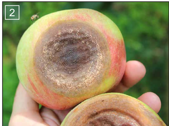
FIGURE 2. SUNKEN LESIONS WITH BULL’S-EYE APPEARANCE ARE TYPICAL OF LATE-SEASON SYMPTOMS OF BITTER ROT.