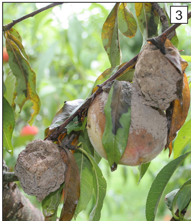
FIGURE 3. ADVANCED FRUIT ROT SYMPTOMS INCLUDE COMPLETELY ROTTED FRUIT THAT MAY REMAIN ATTACHED TO TREES. FIGURE 4. INFECTED FRUIT SHRIVEL (A) AND HARDEN (B) TO BECOME MUMMIES. NOTE SPORULATION. FIGURE 5. IN SPRING, CUP-SHAPED APOTHECIA MAY DEVELOP ON FALLEN FRUIT ON THE ORCHARD FLOOR. ASCOSPORES ARE DISCHARGED FROM THESE FRUITING STRUCTURES.