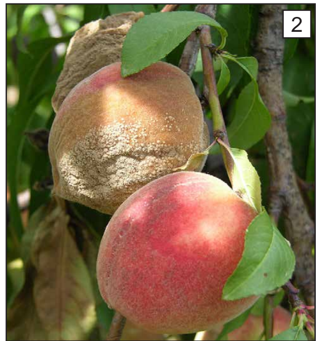
FIGURE 1. BLOSSOM BLIGHT PHASE OCCURS WHEN THE BROWN ROT FUNGUS INFECTS FLOWERS. THIS INITIATES OTHER PHASES OF THE DISEASE. A CANKER (ARROW) DEVELOPS WHEN BLOSSOM INFECTIONS MOVE INTO BRANCHES. FIGURE 2. FRUIT INFECTIONS EXPAND RAPIDLY AND CAUSE FRUIT ROT. BROWNISH, FLUFFY FUNGAL GROWTH IS A DIAGNOSTIC CHARACTERISTIC OF BROWN ROT.

Decay begins as small circular brown spots, which rapidly expand to destroy entire fruit (FIGURE 2). Light-colored tan-to-brown spores (conidia) cover infected fruit tissue (FIGURE 3). Rotted fruit drop to the ground or remain attached to trees and become hard and wrinkled (mummies) (FIGURE 4). Infected fruit (not yet showing symptoms) can rot in storage.