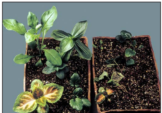
FIGURE 1. DAMPING-OFF CAN RESULT IN SEED DECAY, FAILURE OF GERMINATING SEEDS TO EMERGE, AND/OR COLLAPSE OF YOUNG SEEDLINGS (RIGHT).

Once established in the soil, damping-off organisms are often able to survive for many years even in the absence of host plants. Some survive as saprobes/saprophytes