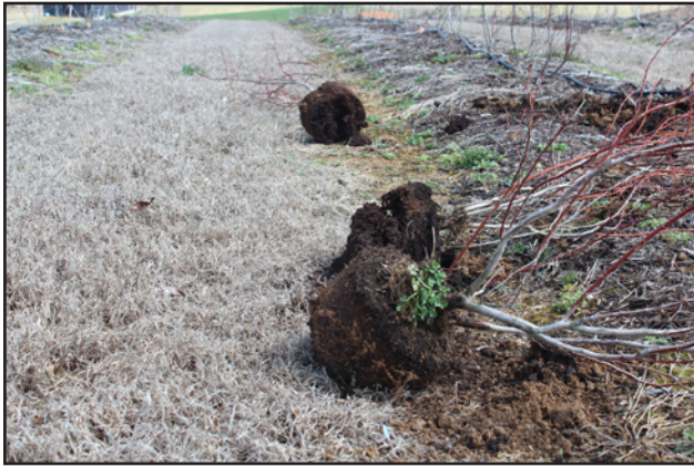
FIGURE 4. ROOT ROT PATHOGENS CAN BUILD UP IN SOILS IF INFECTED PLANTS REMAIN IN FIELDS FOR LONG PERIODS OF TIME.