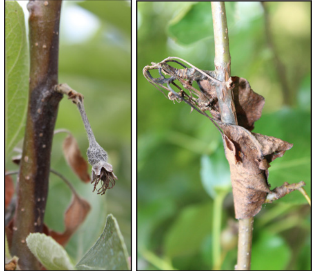
FIGURE 3. CANKERS, OR STEM LESIONS, OFTEN CONTAIN INFECTIVE PATHOGENS. THE FIRE BLIGHT BACTERIUM OVERWINTERS IN CANKERS AND THEN MULTIPLIES AND SPREADS IN SPRING. FUNGAL PATHOGENS MAY ALSO OVERWINTER IN THIS DEAD TISSUE.