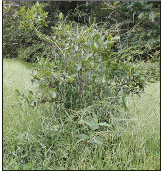
FIGURE 5. WEEDS AND VOLUNTEER PLANTS CAN BECOME HOST PLANTS FOR SOME PATHOGENS AND SERVE AS A RESERVOIR UNTIL MORE SUITABLE HOST PLANTS BECOME AVAILABLE.