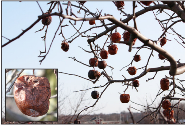
FIGURE 2. DISEASED FRUIT CAN SERVE AS SOURCES OF INFECTIVE SPORES OR SERVE AS OVERWINTERING SITES FOR PATHOGENS. FRUIT THAT REMAINS ATTACHED TO PLANTS AND THOSE THAT FALL TO THE GROUND ARE EQUALLY INFECTIOUS.

When disease management is neglected, pathogen populations build-up and continue to increase as long as there is susceptible plant tissue available for infection and disease development. Infected plant tissue, infested soil, and pathogen propagules all serve as sources of pathogens that can later infect healthy plants.