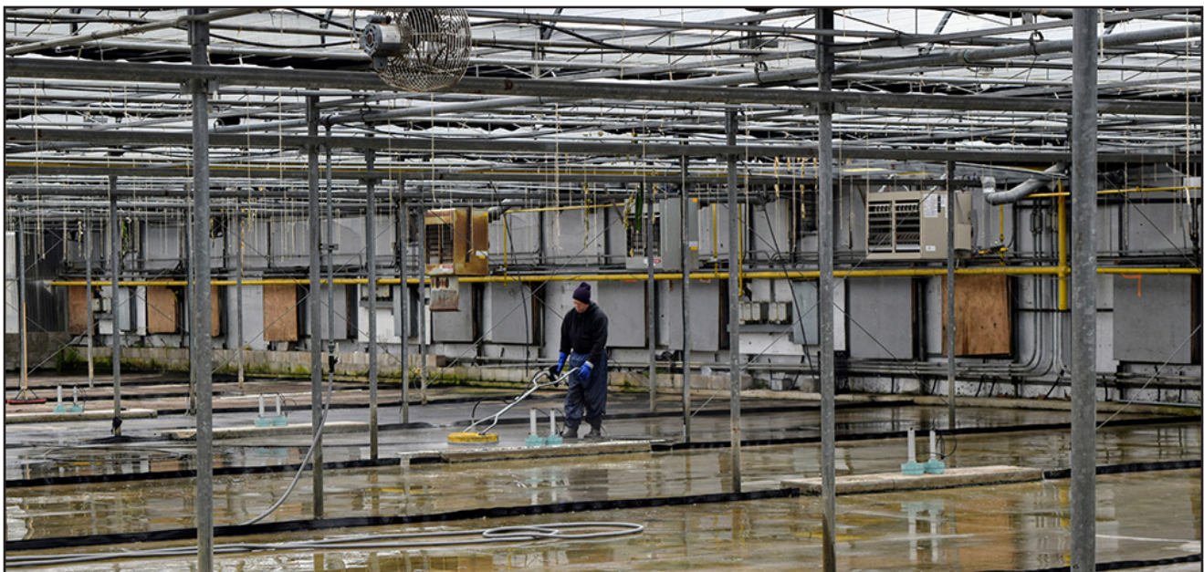
FIGURE 1. GREENHOUSES SHOULD BE EMPTIED, CLEANED, AND SANITIZED BETWEEN CROPS IN ORDER TO ELIMINATE DISEASE-CAUSING PATHOGENS.

The following cleaning and sanitation protocol applies to all commercial greenhouses, regardless of size.