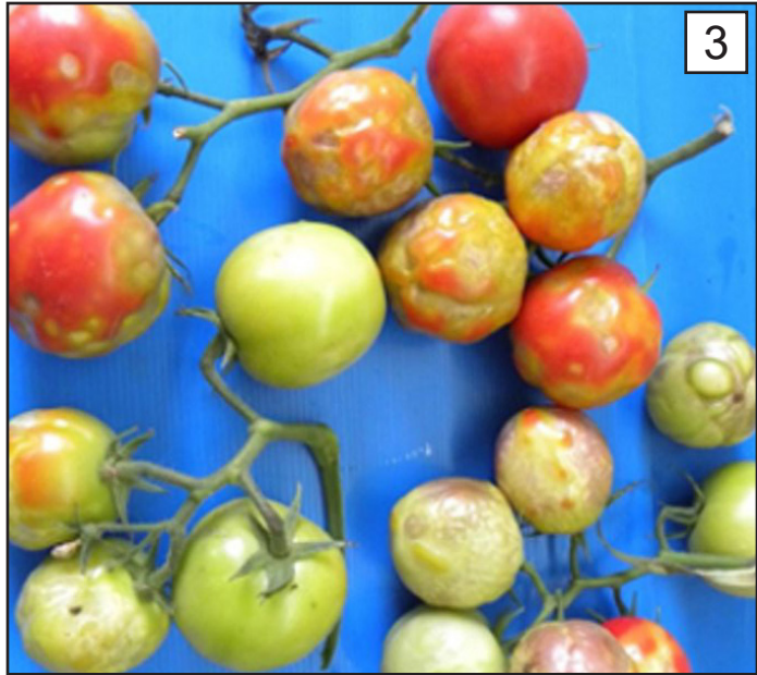
FIGURE 3. TOMATO BROWN RUGOSE FRUIT VIRUS (ToBRFV) DAMAGE TO TOMATO FRUIT CAN INCLUDE MOSAIC COLORATION, DISTORTION, AND NECROSIS.