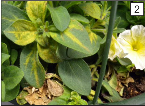
FIGURE 2. TURNIP VEIN CLEARING VIRUS (TVCV) SYMPTOMS ON PETUNIA INCLUDE YELLOW STREAKS ALONG VEINS THAT ORIGINATE AT PETIOLES.