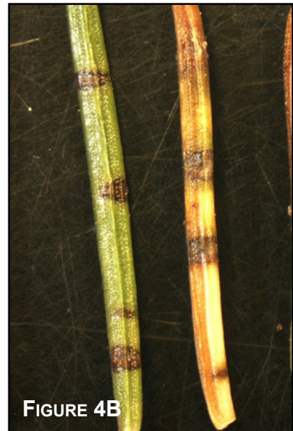
FIGURES 4A & B. BANDING FROM DOTHISTROMA NEEDLE BLIGHT ON SPRUCE IS SIMILAR TO BANDING ON PINE NEEDLES.