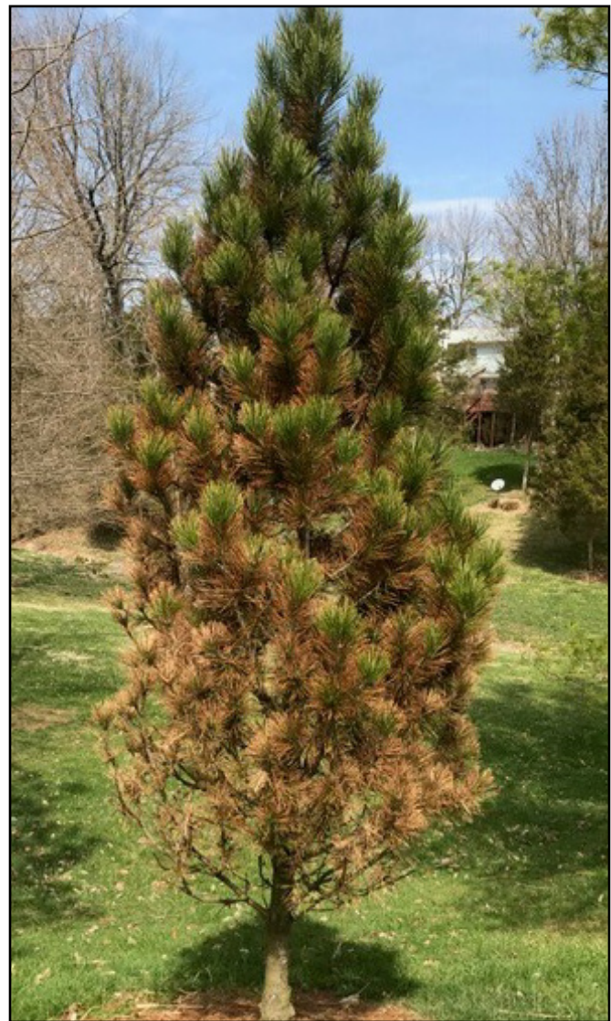
FIGURE 1. DOTHISTROMA NEEDLE CAST SYMPTOMS BEGIN ON LOWER BRANCHES AND PROGRESS UPWARD.

Needle blight symptoms begin as dark green spots on infected needles as soon as 1 month after infection. This earliest symptom is often overlooked. Later, distinctive brown or reddish spots are visible on needles, sometimes encircling needles to form bands of discolored tissue (FIGURE 2). These needle-banding symptoms are usually not noticeable until autumn or winter, or even early the following spring. Black pimple-like fungal fruiting bodies may be visible as needle tissue becomes necrotic (FIGURES 3A & 3B). Blighted needles can either remain on trees or may drop prematurely. Needle browning tends to develop on lower branches and progress upward (FIGURE 1). Symptoms on spruce are similar to those on pine (FIGURES 4A & 4B).