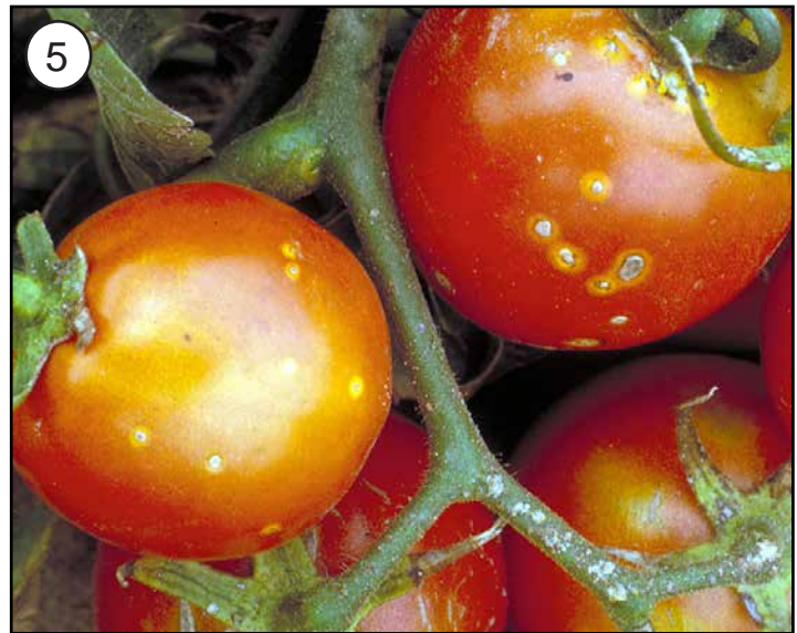
FIGURE 3. MARGINAL NECROSIS OF OLDER LEAVES (OFTEN CALLED “FIRING”) OCCURS AS A CONSEQUENCE OF FOLIAR INFECTIONS. FIGURE 4. CLOSE-UP OF A TOMATO LEAF SHOWING “FIRING” SYMPTOMS. FIGURE 5. SECONDARY INFECTIONS FROM RAIN-SPLASHED BACTERIA CAUSE BLISTER-LIKE LESIONS. FIGURE 6. INFECTED FRUIT DEVELOP “BIRDS-EYE” SPOTS THAT REDUCE FRUIT QUALITY.

As symptoms progress, marginal browning or necrosis (also called “firing”) becomes evident on older leaves (FIGURES 3 & 4). Firing occurs when the pathogen is present on leaf surfaces, causing foliar infections. Brown (necrotic) leaf tissues may have a yellow border, and affected leaves tend to curl upward. Secondary foliar infections from rain-splashed bacteria develop circular, somewhat raised lesions with brown centers and white-tan margins (FIGURE 5).