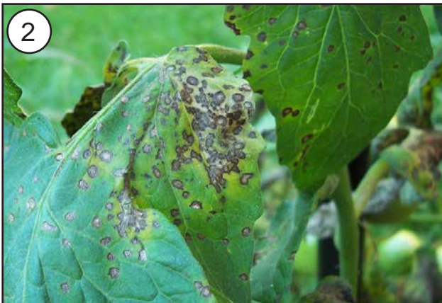
FIGURE 1. EARLY BLIGHT IS CHARACTERIZED BY TARGET-LIKE LESIONS WITH CONCENTRIC RINGS.