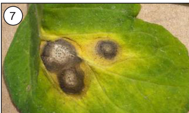
FIGURE 7. THE CENTERS OF SEPTORIA LEAF SPOT LESIONS BECOME DOTTED WITH FUNGAL FRUITING BODIES (PYCNIDIA).

Septoria leaf spot first develops on lower foliage and progresses up the plant. It can occur at any stage of plant maturity, but commonly develops after the first fruit set. Lesions can appear on stems and leaflets. The circular to semi-circular spots have tan to gray centers with dark brown margins (FIGURE 2); centers become dotted with black spore-producing structures (pycnidia) (FIGURE 7). Spots are often surrounded by a yellow halo and individually remain smaller than 1/3 inch in diameter. However, Septoria lesions often merge, progressing to a blight that kills leaves and causes plants to defoliate. Infections on fruit are exceedingly rare.