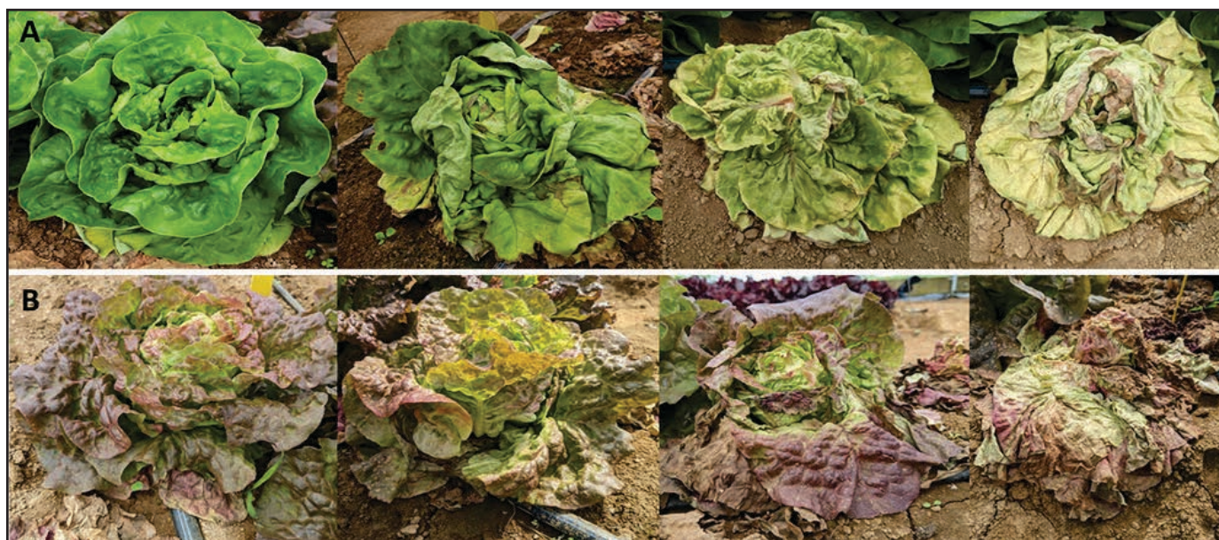
FIGURE 1. PROGRESSION OF LETTUCE DROP SYMPTOMS (LEFT TO RIGHT) ON CULTIVARS (A) HARMONY AND (B) PIRAT PLANTED IN A HIGH TUNNEL IN LEXINGTON, KENTUCKY

Soil water did not consistently affect lettuce drop incidence or yield, but planting date and cultivar consistently affected incidence in both years.