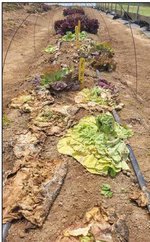
FIGURE 2. FIELD IMAGE FROM 2023 SHOWS PLANTS AFFECTED BY LETTUCE DROP IN THE MID PLANTING DATE TREATMENT. IN THE FOREGROUND, CULTIVAR HARMONY FROM EARLY PLANTING DATE (64 DAYS AFTER PLANTING AND 10 DAYS AFTER HARVEST), FOLLOWED BY MID PLANTING DATE CULTIVARS PIRAT, HARMONY, GALACTIC, AND VULCAN (44 DAYS AFTER PLANTING).