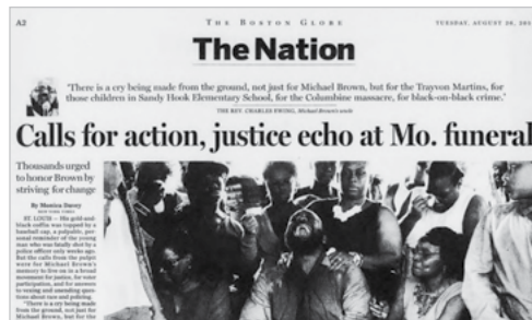
August 26, 2014 (Page A2). (2014, Aug 26). Boston Globe (2008-Recent)

—historical archives, from the late 1700s to the early 2000s, explore spans of time across geographies. The top news sources in the world are the gold standard in historical news databases. With nearly 200 historical titles, including local titles and packages to help users go deep into the events and people in their town and state, and specialty, international and topical collections for viewpoints that help develop research.