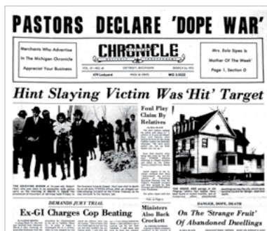
Black, B. (1973, Mar 24). Hint Slaying Victim Was 'Hit' Target: Foul Play Claim By Relatives. Michigan Chronicle (1939-Current)

Research a topic from every angle, across time and geography. With ProQuest Historical Newspapers, ProQuest Recent Newspapers and ProQuest Global Newsstream—all cross-searchable on the ProQuest platform—researchers access unprecedented coverage of people, places and events from the earliest newspaper publications to current-day reports.