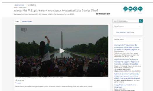
Across the U.S., protesters use silence to memorialize George Floyd. (2020, Jun 04).[Video/DVD] Washington, D.C.: WP Company LLC d/b/a The Washington Post.

—a digital archive to complement Historical Newspapers, providing access to recent news across the world, beginning in the late 2000s and goes through the most recent issue, with a content currency delay of a week or less.