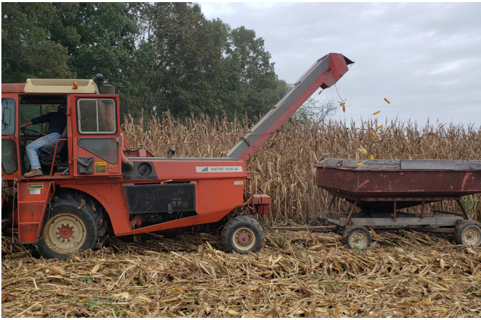
Producer picking ear corn