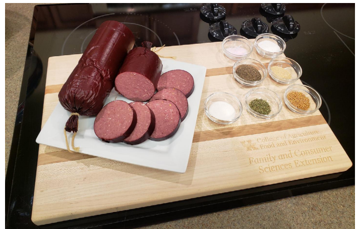
Venison Summer Sausage