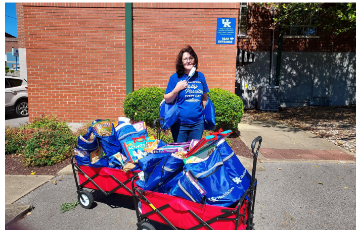
Grab and Go Kindergarten Readiness Bags

This field day was comprised of video recordings from producers in the Mammoth Cave Area. The topics of this field day included high tunnel strawberry production, livestock feeding pad usage and eared corn production. The virtual field day was held in October 2021. There were 112 attendees. 100% of the respondents to our survey indicated they learned something that will benefit them. Over 96% rated the virtual field day as an excellent program, and 28% indicated they will make a change to their farming operation.