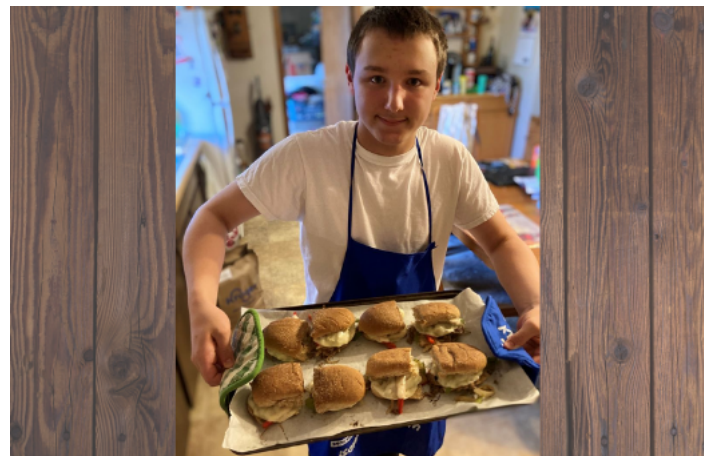
Tasty Philly Cheesesteaks made by a Carroll County 4-H'er.