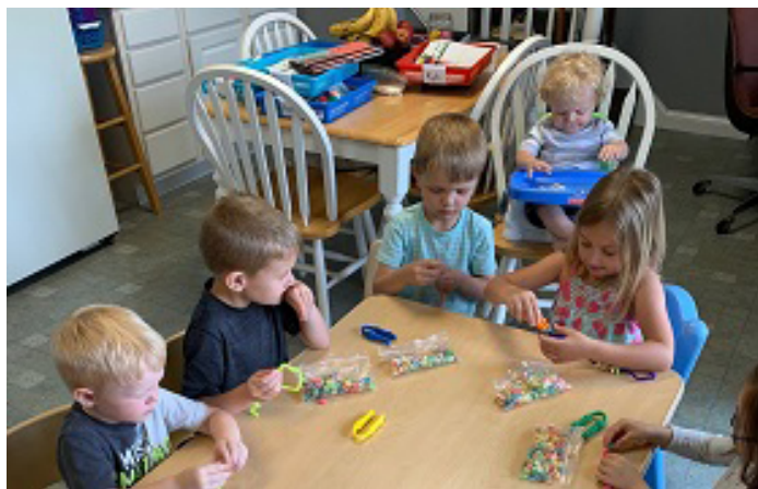
Counting and having fun with gator grabbers during Summer Smart Start Academy.

260 Number of individuals who reported increased knowledge, skills, or intentions related to using the nutrition facts label.