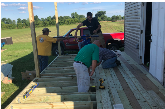
4-H Volunteerism at the County Fair.

50 Number of youth who participated in project, activity, or event for science, engineering, and technology projects.