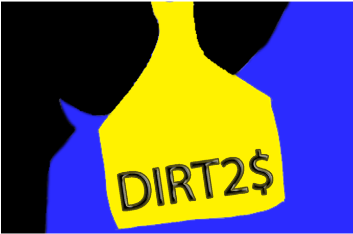
Dirt 2 Dollars Logo