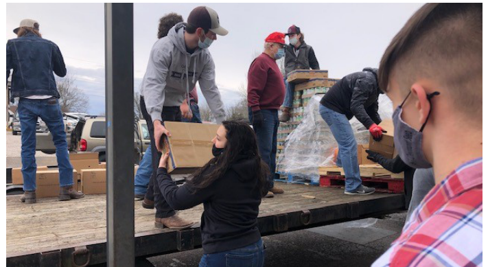
Hart County 4-H members are shown unloading one of the trailers filled with food to be distributed at the Food Bank.

Poor nutrition and physical inactivity are tied to obesity. Recent research shows that among U.S. children ages 2 to 4, nearly 14% were overweight and 13.5 were obese. Obesity has been shown to contribute to major health issues including high blood pressure, type 2 diabetes, elevated blood cholesterol levels, low self-esteem, negative body image and depression in children. To address these concerns, the Hart County Family and Consumer Sciences Agent collaborated with the Hart County Head Start to offer the LEAP for Health program to 14 pre-school students. Lessons focused on teaching children about nutritious foods, healthy eating habits, food safety and being physically active. As a result of the program 100% of the children were able to recognize physical activity, healthy snacks, and 98% were more willing to try new fruits and vegetables.