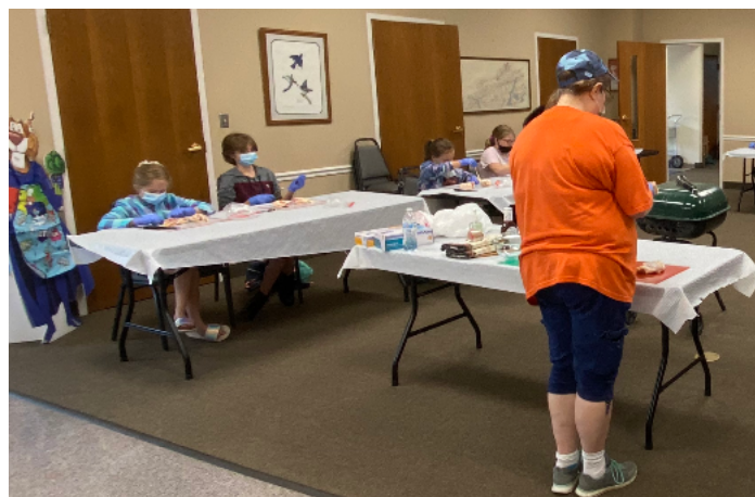
4-H Youth learning how to safely handle raw chicken.

At the state level, speeches were replaced by essays and hams were judged regionally. At county level, hams could not be finished with the producer so they were brought to the extension office. Each youth (wearing masks and social distancing) scheduled a time to finish their hams and choose one to send to the fair for judging (40%-essays and 60%-hams). Even with all the changes, 11 Henderson County youth finished the project. One youth received various awards including Overall Smoked Division winner.