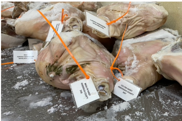
Henderson County Country Ham entries.