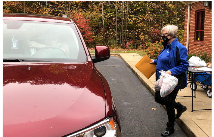
Knott FCS Agent Delivers Project Bags to Knott County Resident.

The 4-H STEM project also included a career connection to engineering, so the youth would have a chance to learn about attributes of engineers. Youth identified which of the attributes they were most proficient at, and utilized them during the lesson. GEAR UP promotes collage and career readiness. This will be an ongoing partnership.