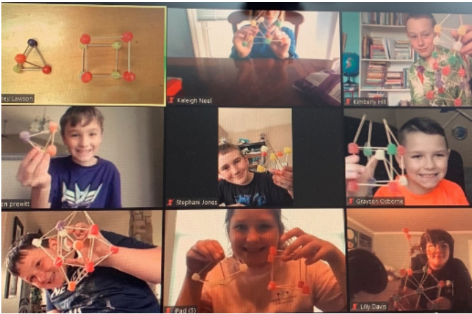
4-H'ers explore science during SET Club.