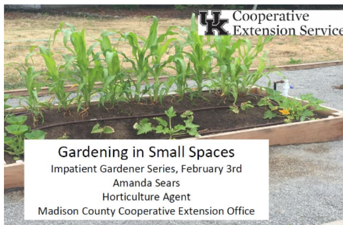
“Gardening in Small Spaces” was one of the seven classes offered in this series.

Throughout 2021 we partnered with Eastern Kentucky University and Berea College Upward Bound Programs to serve 25 high school students and their families with virtual cooking classes. Due to the pandemic, the students attended classes via Zoom and received cooking kits via mail, which contained a wide variety of utensils and cooking supplies. They were responsible for getting their ingredients at their local grocer and learned different shopping and budgeting techniques as well. The lessons varied in degrees of difficulty and were all derived from our 2021 NEP Calendar or Plate It Up recipes, as well as a couple of made-from-scratch microwave recipes. We also incorporated mini lessons into each recipe in relation to health, nutrition, and wellness. The students reported that they really enjoyed our program in the spring, and the program was extended throughout the summer as well as into the fall.