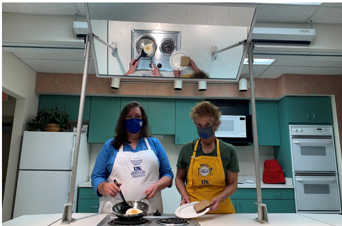
Agent and assistants preparing for the virtual Cooking Club.