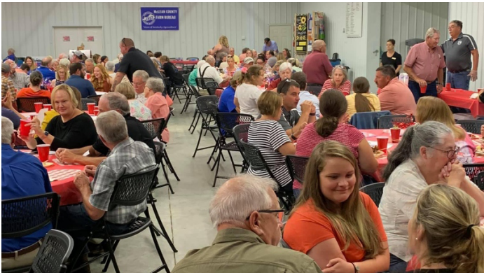
Farm Bureau Annual Meeting first to use new chairs and tables.