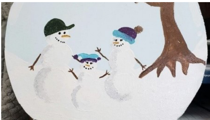
Snow globe door hanger made from the first kit.