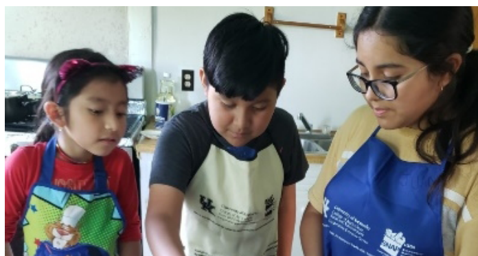
Siblings are pictured above working together to create a peach cobbler.

In a three-county region in Northern Kentucky, the Owen/Gallatin/Carroll County Nutrition Education Program Assistant came up with an idea for Day Camp in a Bag. Working with Gallatin and Carroll County 4-H youth development, Family and consumer sciences, and Agriculture natural resources departments, the program served 56 families with more than 150 young people. In Owen County, the Day Camp in a Bag was expanded to include gardening. Families received resources to set up the young people with the items they needed to plant their own Victory Gardens. The Nutrition Education Program Assistant provided on how to take care of the plants and dry the herbs. According to two Owen county youth participants, they enjoyed the chance to learn more about cooking. One youth particularly liked the enchilada recipe that was in one of the bags, because it was, "Quick and easy to make." Another participant reported that she enjoyed using the garden.