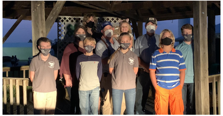
Pictured above are the Owen County Livestock Club members with one of the buyers who contributed to each members sale.

The Owen County 4-H program was without a 4-H Agent for several months. The 4-H adult advisory council expressed the need to discuss and safely plan the 4-H Livestock Club Youth Investment Sale, during a pandemic. The Livestock Council also wanted the youth to be able to experience the sale of their animal to gain financial literacy skills; the video was used for the sale. The Owen County 4-H Livestock Club Youth Investment Sale had 26 buyers from Owen County or the surrounding area to participate virtually. In the past years, those youth that participated in the 4-H Country Ham project had the option to sell their ham in the investment sale and a silent auction was held for those participants. In total, the program had 15 youth participate whether it was a livestock/hams. Due to generous donations, we were able to raise almost $18,000.00 that goes back to the 4-H Livestock Club in Owen County; to sustain the program for many years to go