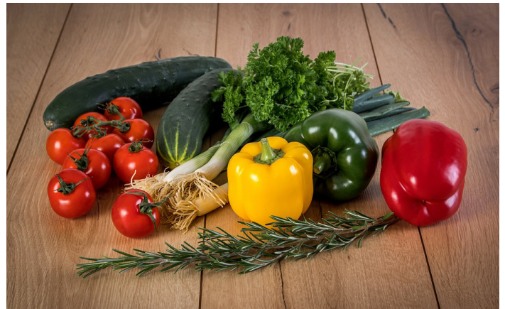
2021 Grab n' Grow Garden Series.

Other behaviors also impacted by recipe club participation was learning a new technique or skill from preparing the recipes and tried a new ingredient in their cooking.