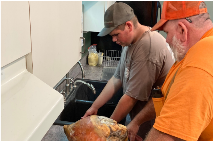
4H Volunteer oversees Country Ham cleaning.