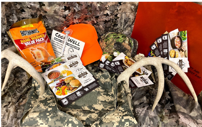
Cook Wild Kentucky packet contents.