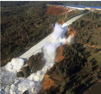
Extreme precipitation from several ARs contributed to a flood risk management crisis at California's Oroville Dam in early 2017.