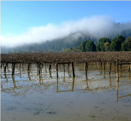
Torrential rain from a severe winter storm causes the Russian River to spill over into this vineyard in Sonoma County, CA.