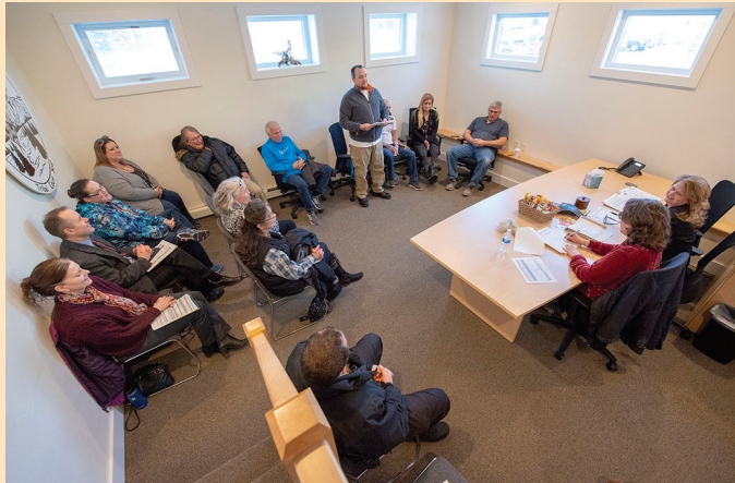
Henu Community Wellness Court in session in the Kenaitze Tribal Courthouse.