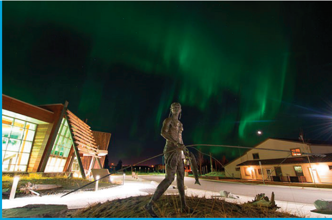
The Dena'ina Wellness Center and Na'ini Family and Social Services buildings near the Kenaitze Tribal Courthouse.