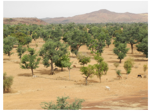
Farmer-managed natural regeneration near Rissiam in northern Burkina Faso, Africa.

The Landsat program is a joint effort between the U.S. Geological Survey (USGS) and the National Aeronautics and Space Administration (NASA), but the partner agencies have distinct roles. NASA develops remote-sensing instruments and spacecraft, launches satellites, and validates their performance in orbit. The USGS owns and operates Landsat satellites in space and manages their data transmissions, including ground reception, archiving, product generation, and public