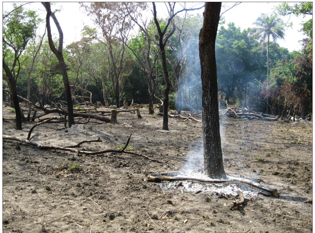
Slash-and-burn agriculture contributes to deforestation in the Upper Guinean forest in Sierra Leone, Africa.

The current satellites in the Landsat program, Landsat 7 (launched in 1999) and Landsat 8 (launched in 2013), provide complete coverage of the Earth every eight days. A Landsat 9 satellite is scheduled for launch in late 2020.