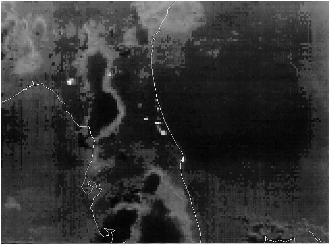
FIG. 4. GOES experimental fire product image taken during the 1998 fire situation in Florida. Note the fires (white spots) in eastern Florida near Daytona Beach and north of Cape Canaveral, and some more tightly grouped fires in the northwestern part of the Florida peninsula.

field experiments and joint research projects with the NWS and other NOAA laboratories.