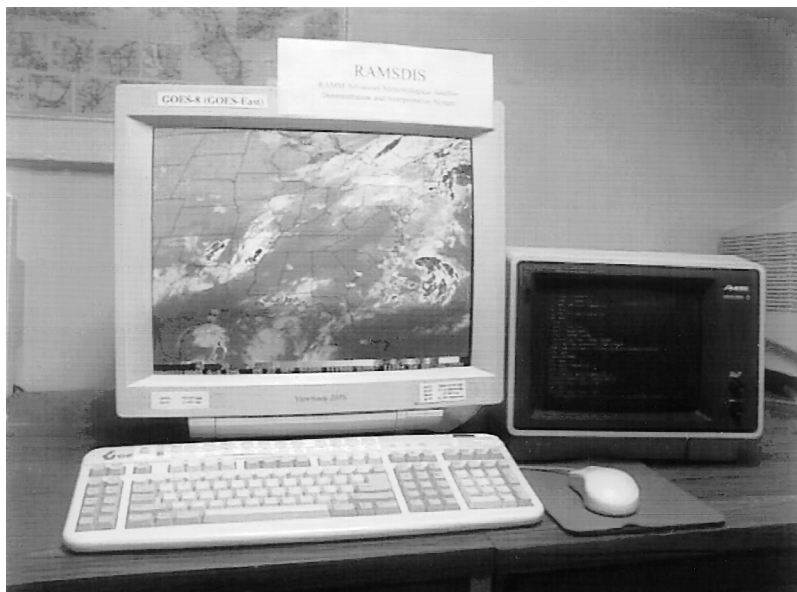
FIG. 2. RAMSDIS image display and command monitors.

One of the most exciting features of the new GOES satellite was the availability of the 3.9\text{-}\mu\text{m} channel. Data from the channel are unlike previous GOES IR channels in that they contain both reflected solar and emitted terrestrial radiation. RAMSDIS provided an ideal platform for the testing of experimental products utilizing this new information. The fog product is generated by subtracting the 3.9\text{-}\mu\text{m} scene temperature from the 10.7\text{-}\mu\text{m} scene temperature and scaling the results to show positive and negative differences. This technique, in use for over a decade with data from polar-orbiting satellites, is based on the principle that the emissivity of water cloud at 3.9\ \mu\text{m} is less than at 10.7\ \mu\text{m} . Figure 3 illustrates a fog product image. The