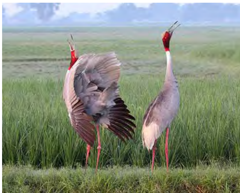
Sarus cranes unison call in rice fields in India