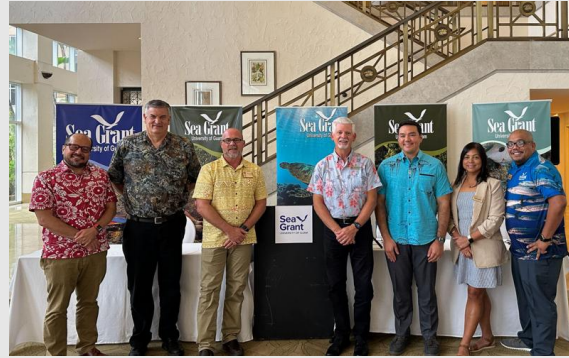
Local 2030 Announcement during Sea Grant Association Meeting in Guam