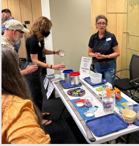
2023 Great Lakes Sea Grant Network Meeting in Evanston, IL