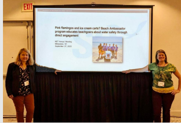
Sea Grant at 2023 National Extension Tourism Conference