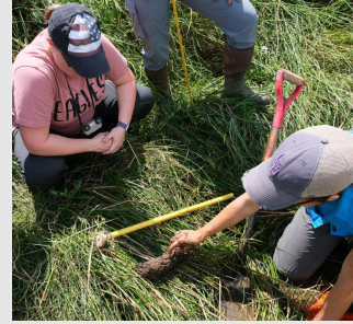
Louisiana Sea Grant-led Teacher Professional Development