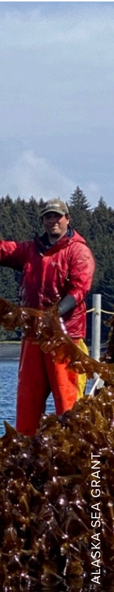
ALASKA SEA GRANT

The AK On-Board commercial fisherman training project will combine expertise and tried-and-true training methods from programs led by Alaska Sea Grant, the Alaska Longline Fishermen's Association, the Alaska Marine Conservation Council, and the Alaska Marine Safety Education Association, to provide regional training and mentorship opportunities for aspiring commercial fishermen. Applied skills training will give new crewmembers the basic technical and safety skills to be competent and professional on the water. Apprenticeships will facilitate professional relationships between new crew and experienced captains to share valuable experience. Networking opportunities will create cohorts of aware stakeholders with the knowledge to successfully engage in the fishery management process.