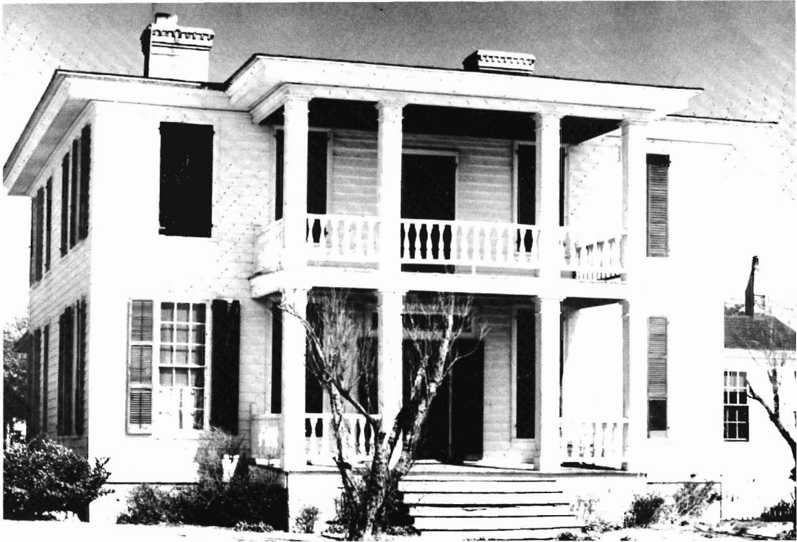
Figure 2.—U.S. Fishery Laboratory, Duncan House, Beaufort, N.C., 1899-1902.