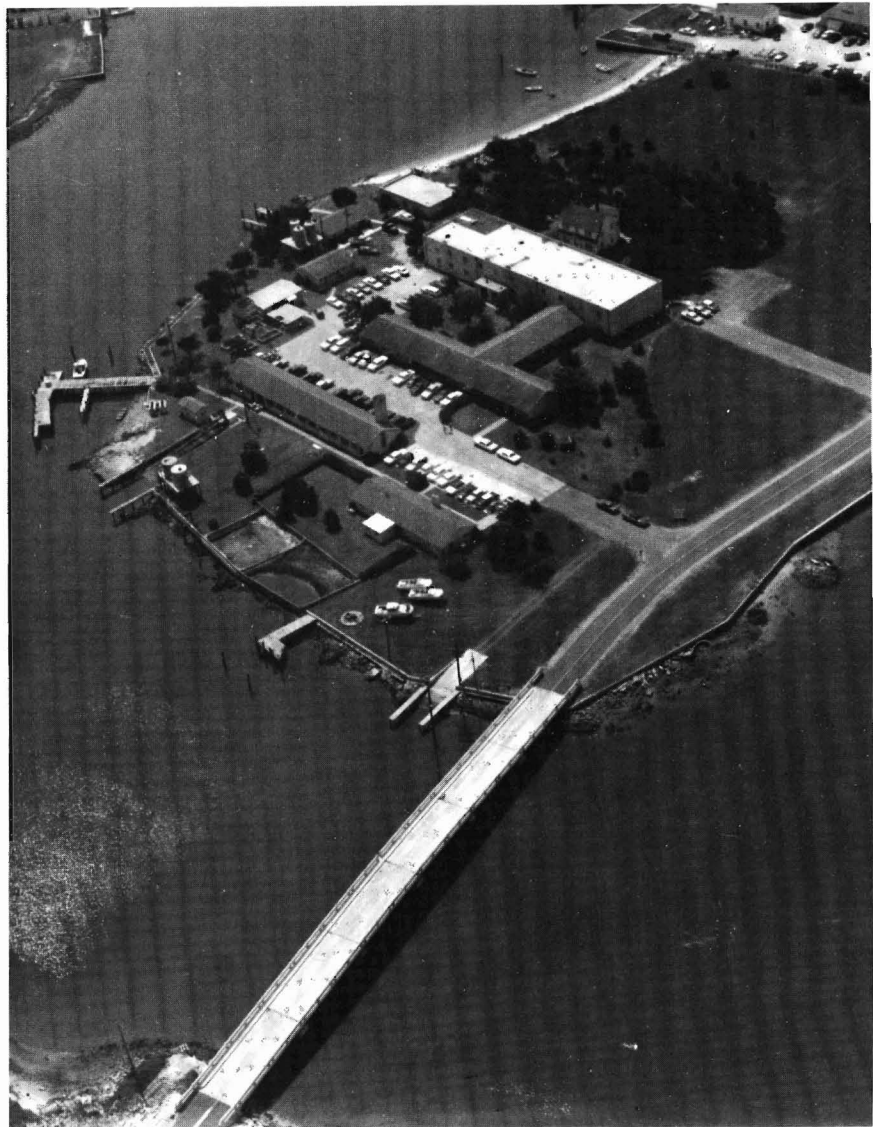
Figure 6.—U.S. Fishery Laboratory, Pivers Island, Beaufort, N.C., 1954-present.