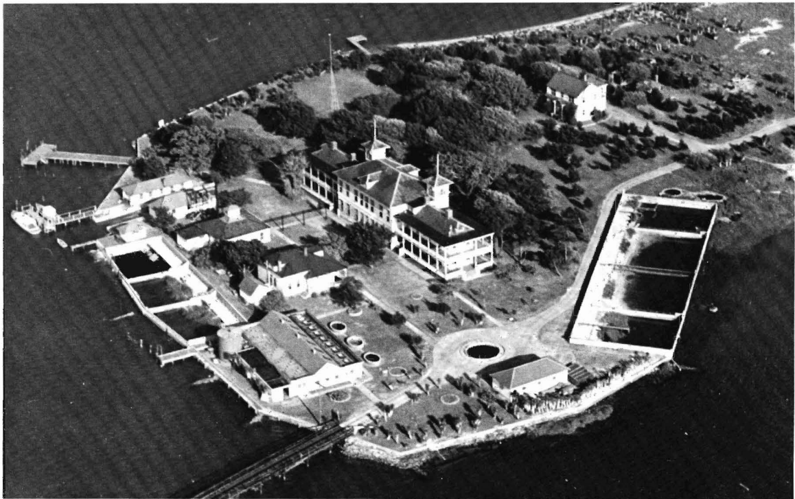
Figure 3.—U.S. Fishery Laboratory, Pivers Island, Beaufort, N.C., 1902-1954.