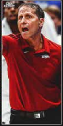
COLLEGE BASKETBALL REPORT