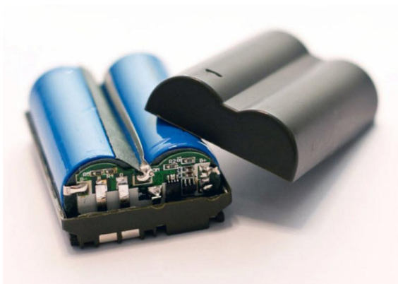
Figure 2: a common type of battery

Battery packs, modules or battery assemblies manufactured to provide a source of power to another piece of equipment are treated as batteries in TDG regulations.