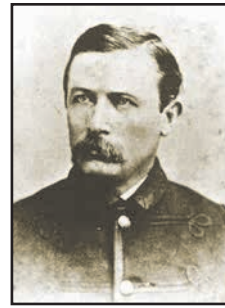
Col. Ranald S. Mackenzie

The decisive battle of the Red River War, 1874-1875, was the final campaign against the Southern Plains Indians.