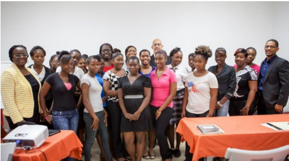
Young ladies from fourth form to tertiary level attended the "HEART Girls Business Revolution" workshop at the GATE ICT cadet training facility