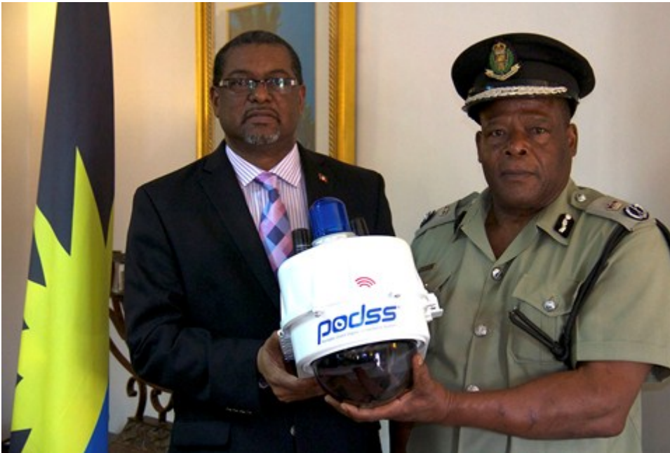
Seen above: National Security Minister Dr. the Hon. L. Errol Cort and Commissioner of Police Mr Vere Browne with one of the cameras

pletely IP based meaning that cameras can be securely monitored, recorded and administered from any workstation or portable device within the local or wide area network.