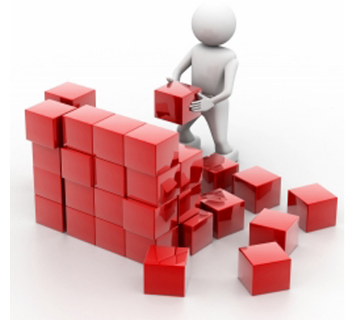
Illustration by Ranjith Krishnan / freedigitalphotos.net

pants in the NCI Clinical Trials Cooperative Group Program, which is designed to promote and support clinical trials of new treatments and explore prevention/early detection methods.