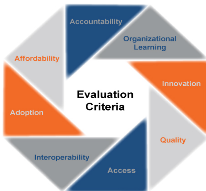
FIGURE 2. LEARNING IMPACT AWARD EVALUATION CRITERIA

IMS Global’s annual Learning Impact Awards Program is conducted on a global scale to recognize outstanding, innovative applications of educational technology to address significant educational challenges. Regional winners, along with other finalists selected by LIA evaluators, all advance to the final round of competition, which is held in conjunction with the annual Learning Impact Leadership Institute. Evaluators assess LIA entries based on the use of technology in an educational institution context, using eight Learning Impact evaluation criteria , as illustrated in Figure 2. The platinum, gold, silver, and bronze medalists are announced at the Leadership Institute.