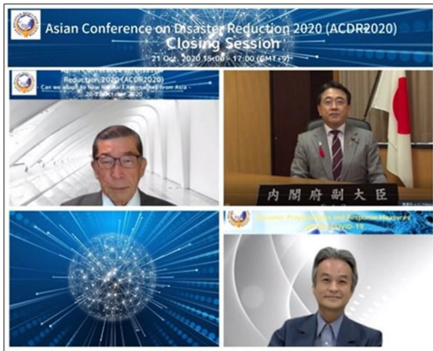
Figure 2.4. Closing Session Speakers