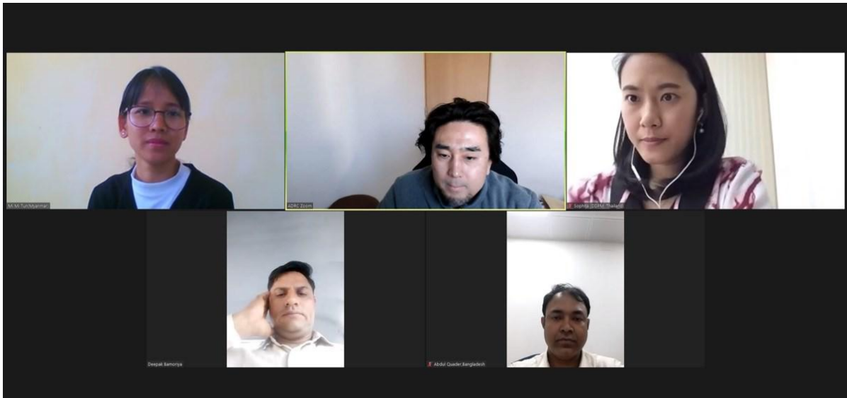
Figure 4.2. Visiting Researchers FY2020