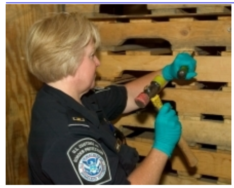
Lacey Act Phase VII Requirements