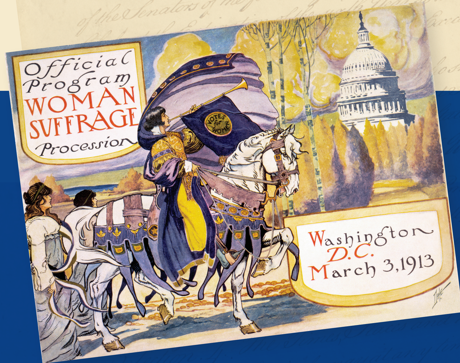
Official program for the Woman Suffrage Procession held in Washington, D.C., March 3, 1913