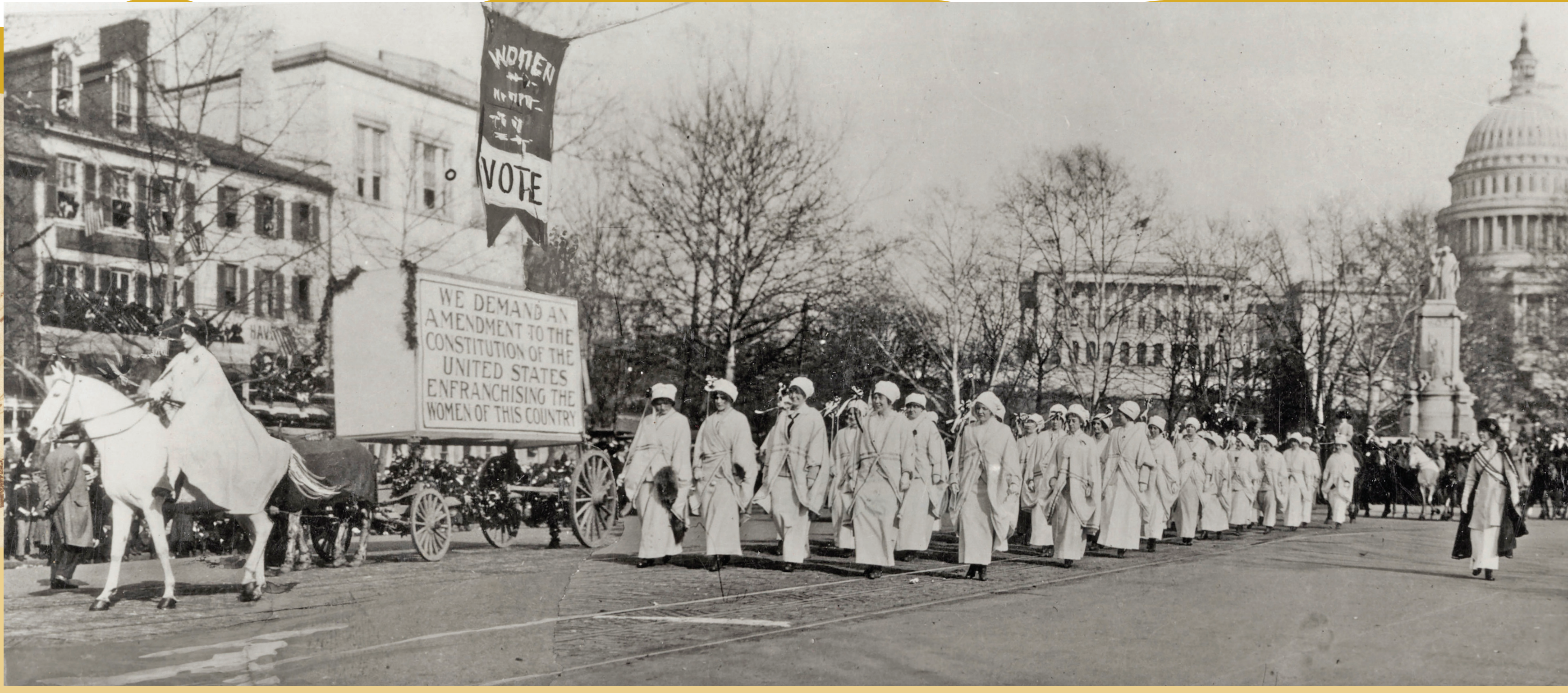
Woman suffrage parade, Washington, D.C., 1913

We the People of the United States, in Order to form a more perfect Union, establish Justice, insure domestic Tranquility, provide for the common defence, promote the general Welfare, and secure the Blessings of Liberty to ourselves and our Posterity, do ordain and establish this Constitution for the United States of America.