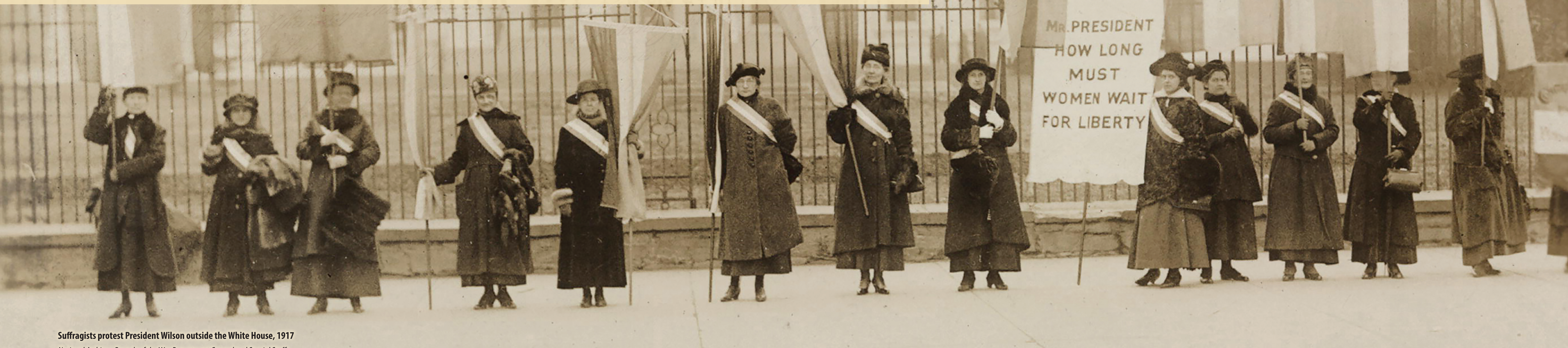
Suffragists protest President Wilson outside the White House, 1917