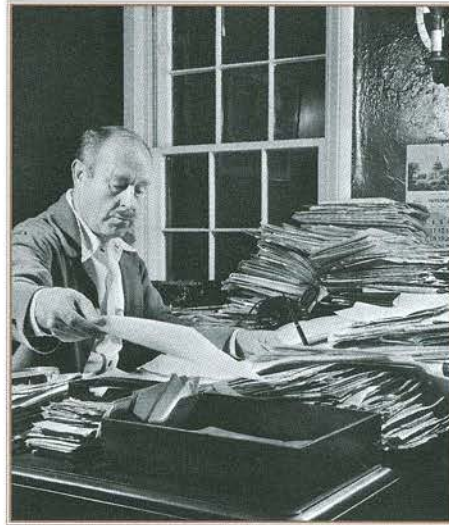
Columnist Drew Pearson, McCarthy's harshest press critic, broke the story of the Colony dinner, during which Father Edmund Walsh allegedly counseled McCarthy that communist infiltration would continue to be the top domestic concern in the coming years and thus a good campaign issue.

interested witness, there was another—Walsh himself. To columnist Marquis Childs, Walsh conceded he had met McCarthy at “a dinner party” and they chatted about “a fixed pension for persons reaching sixty-five years of age.” He did not mention discussing communism and termed “the fantastic report that it was I who was his intimate counselor in his campaign against the State Department” the product of an “evil mind.” While at times Pearson did insinuate a deeper role for Walsh—and Georgetown—rather than simply mention