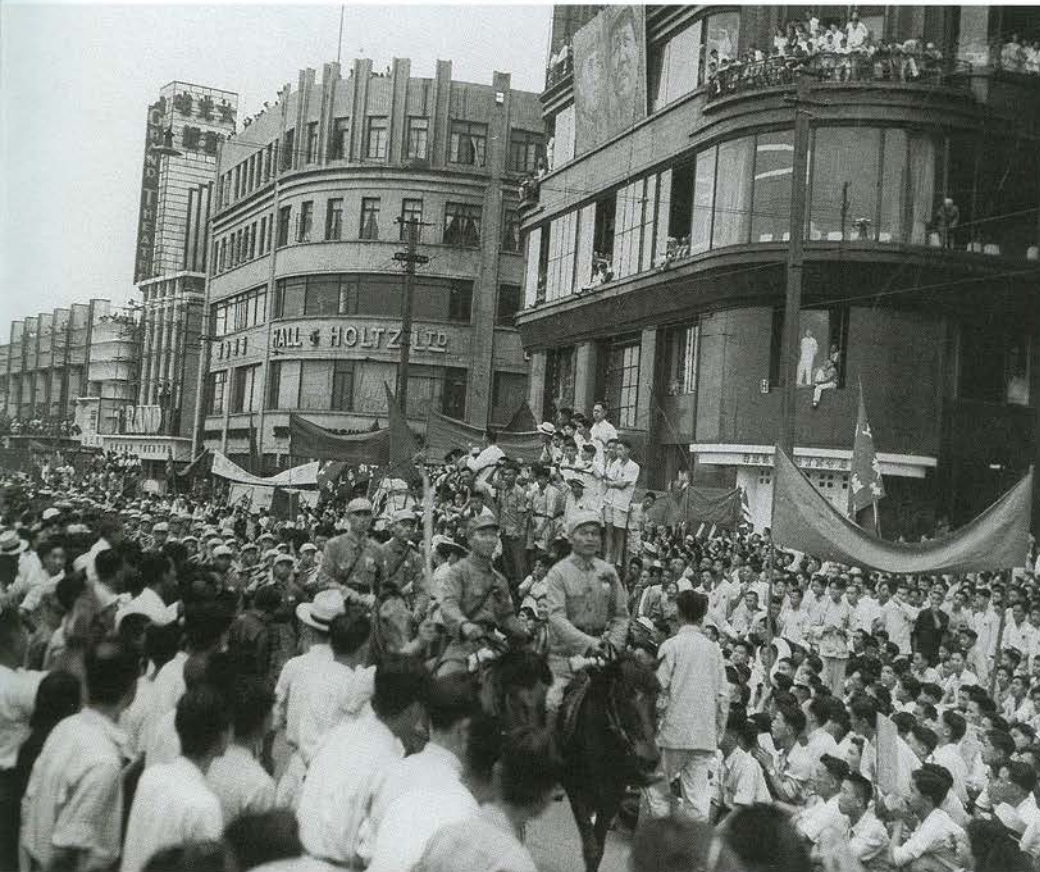
Communist cavalry riding down Nanking Road after the Communist takeover of Shanghai, September 29, 1949. This consequential development, and others, such as the Alger Hiss case, were part of several political “shocks” in that era that fed popular ideas of Communist conspiracy.