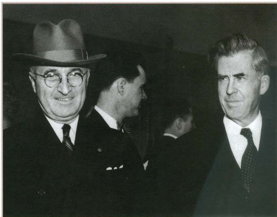
Henry Wallace (shown with President Truman) demonstrated the popular susceptibility to fears of conspiracy of the early 1950s when he telephoned presidential adviser Joseph E. Davies in January 1950. Wallace was wary of “a possible military dictatorship” in Washington.

McCarthy was neither the sole Republican to garland Lincoln Day with partisan oratory nor the only one to raise the Communist issue, which had already gained prominence in American political discourse. However, his charges were the most melodramatic and specific (though he later waffled on what he had said in Wheeling). They led to a Senate subcommittee investigation of his rapidly shifting accusations and launched five years of political turmoil, during which the junior senator from Wisconsin was seldom out of the headlines. This article treats the circumstances of McCarthy’s seizure of the Communist issue, a topic that interested his critics at the time, the journalists who had to follow and explain his oft-mutating charges, and those seeking to understand his tempestuous career. It was these early months of 1950 that launched what came to be known as