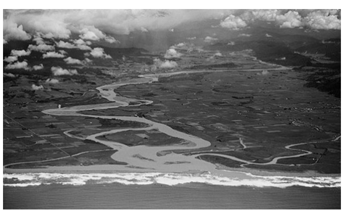
The Eel River meets the Pacific near Ferndale, California.

PMEP Makes Progress on West Coast-wide Assessment