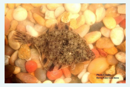
Juvenile starry flounder at the Suisun Marsh, California.

In early spring 2015, PMEP will convene West Coast experts to review a draft of the PMEP assessment report and take key next steps to define priorities for West Coast juvenile fish habitat restoration.