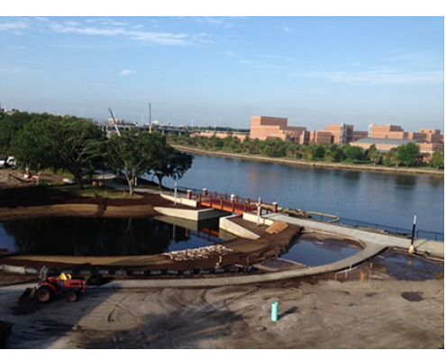
Restoration of Ulele Springs along the Lower Hillsborough River.

On May 28th, 35 participants gathered at the Beck Building in downtown Tampa, Florida to collaborate and share ideas about ways to continue to preserve and protect the lower Hillsborough River through participation in a dynamic workshop titled, "Exploring Best Practices for the Lower Hillsborough River." Presented by