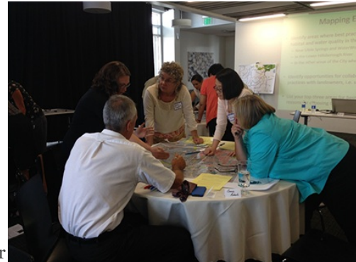
Small group mapping exercise discussions.

, as well as expert presentations on low impact development (LID) techniques and a hands-on small group mapping exercise to identify potential target areas where LID/best practices could protect water quality and habitat. The river is also the focus of the city's new and expanding river walk, providing recreational and economic opportunities