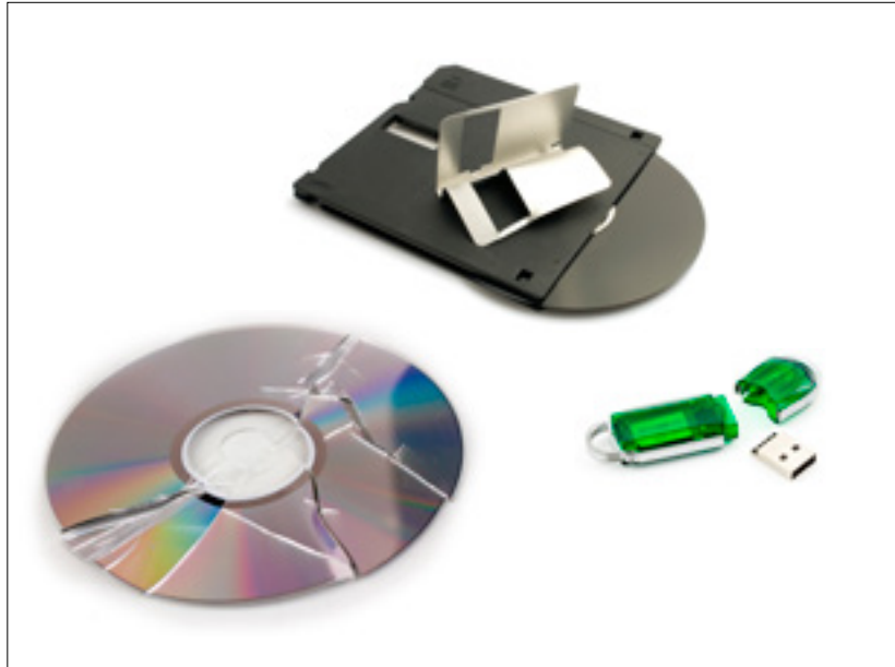
Fig.2: Digital media with physical damage: a CD, a USB drive, a 3.5" floppy disk.

the repository's agreement with the donor or dealer. Physical damage to media may also change the level of preservation and access that a repository can provide. Documenting the physical condition of the files in relation to other factors and making that information easily accessible will facilitate preservation planning. Information about physical condition may also be of interest to future researchers. Donors, dealers, and repositories should not assume that nothing of value can be recovered from digital media just because they may be decades old and battered looking.